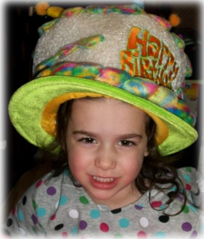
4 years old