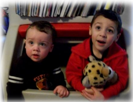
Two Brothers playing in the toy box!