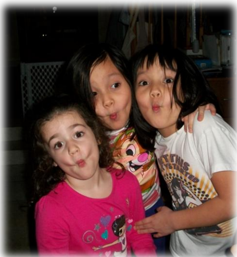
Girls luv this face !!!!!